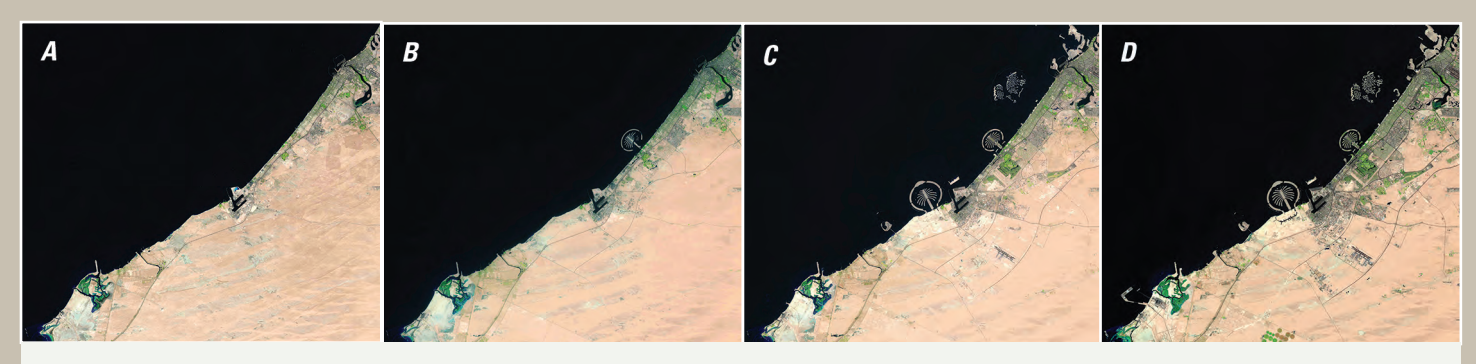
Figure 2. Landsat images showing expanding archipelagos along the coast of Dubai, United Arab Emirates. A , October 1998 (Landsat 5); B , May 2003 (Landsat 7); C , May 2008 (Landsat 5); and D , May 2015 (Landsat 8).

The USGS delivers high quality systematic, geometric, radiometric, and terrain corrected data to users worldwide. Nearly 150 million Landsat images have been downloaded since the USGS adopted the free and open Landsat policy in December 2008.