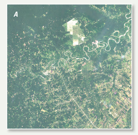
Figure 3. Landsat 8 images acquired May 11, 2014, showing a portion of rain forest in Peru, and displaying the differences in A, standard Level-1 data and B, surface reflectance (SR) data.

Questions about Landsat operations, data products, and data access can be directed to: