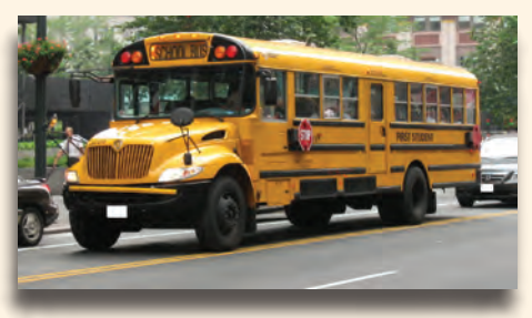
School bus yellow, originally called chrome yellow for the chromium pigment, was adopted for use on school buses in North America in 1939 because black lettering on the yellow buses is easy to see in the semidarkness of early morning.

Many of the decorations on automobiles, such as ornaments, trim, and